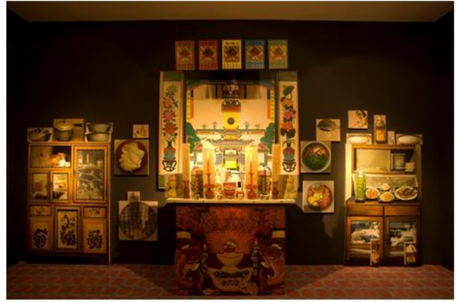
Dong Yuan, "Grandmother's House_ancestors' layer", oil and acrylic on canvas,