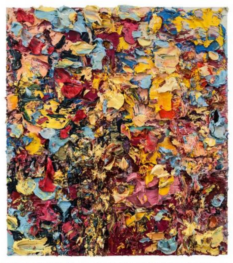
Zhu Jinshi, "The Song of Lhasa 3", Oil on canvas, 70 9/10 x 63 in, 2013, Pearl Lam, 朱金石,《拉薩之歌三》,布面油画, 180 x 160 cm, 2013, 艺术门