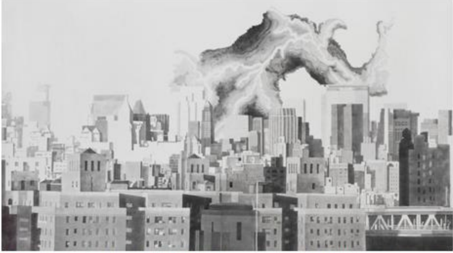
Ye Linghan, "50% Dollar 001", Watercolour on Paper, 190×110cm, 2013, Gallery Yang 叶凌翰, 《50%美金 001》, 纸本水彩, 190×110cm, 2013, 杨画廊