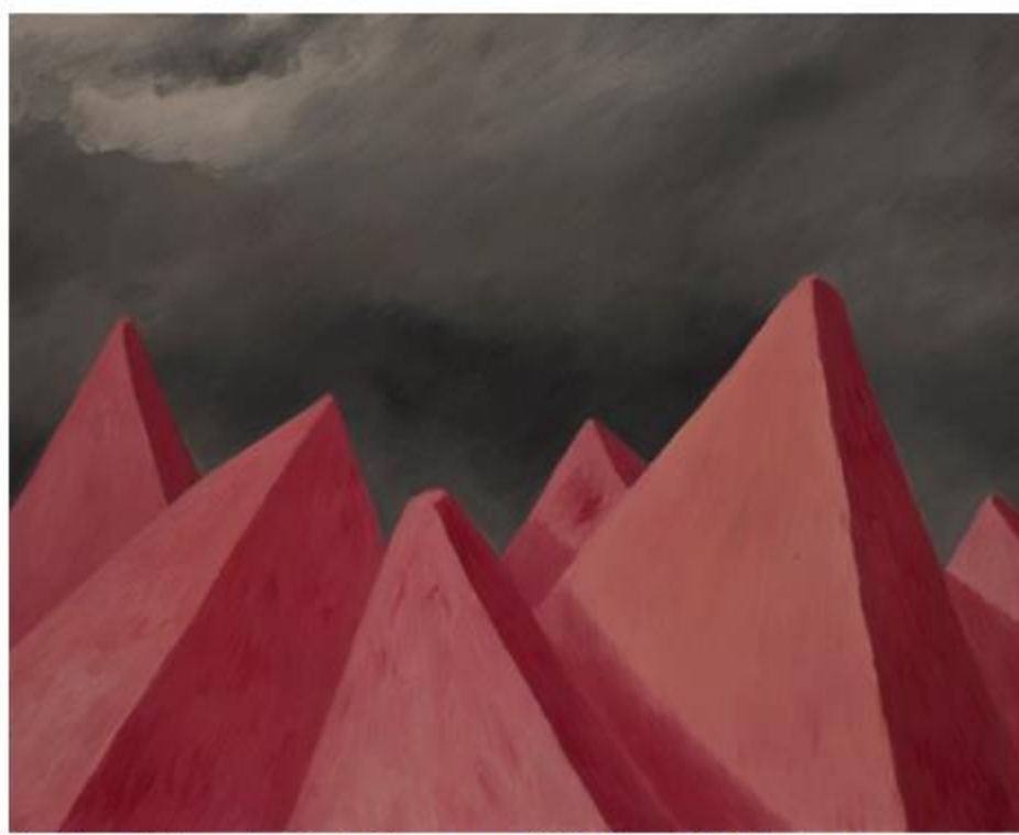
Yan Bing, "Watermelon Red", oil on canvas, 80×100cm, 2012, Gallery Yang, 闫冰,《西瓜红》,布面油画,80×100cm,2012,杨画廊