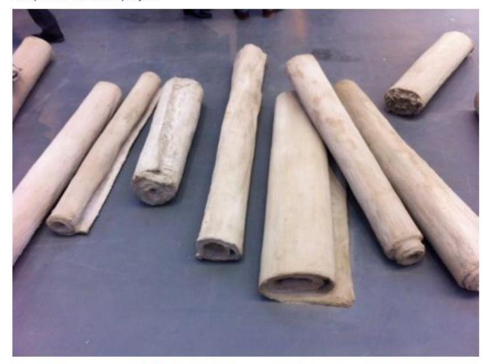
The Emerge section is for galleries under seven years old, like Clerkenwell's Fold, which is showing works by Dominic Beattie (who's collected by Charles Saatchi, dontchaknow).