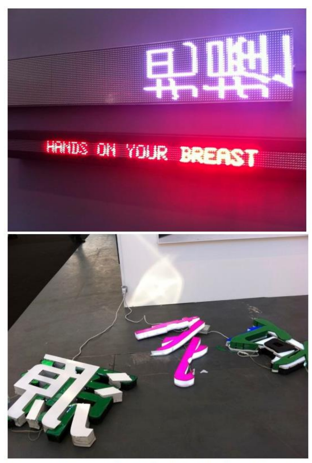
More signage is on show at Tang Contemporary, Beijing (stand C3) courtesy of He An. Apparently, he pinches these neon letters from storefronts, which is a resourceful update of the readymade tradition.