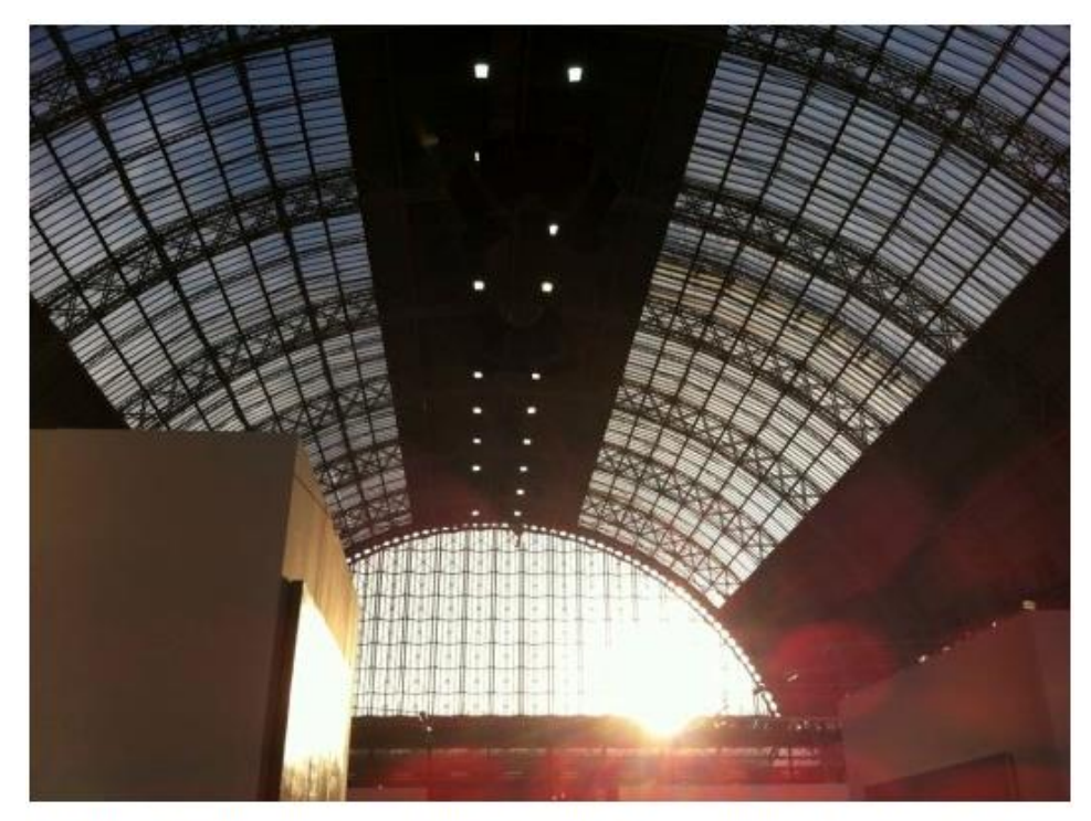
But, with the sun setting over Olympia, this sure is one fair with a feel-good factor. Roll on Art15!