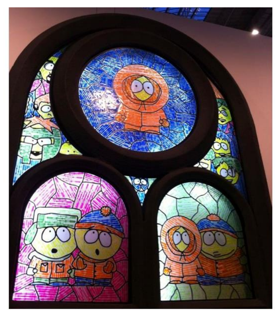
Oh my God, they immortalised 'South Park'! (Stained glass installation by Recycle at Triumph Gallery, Moscow, stand G13).