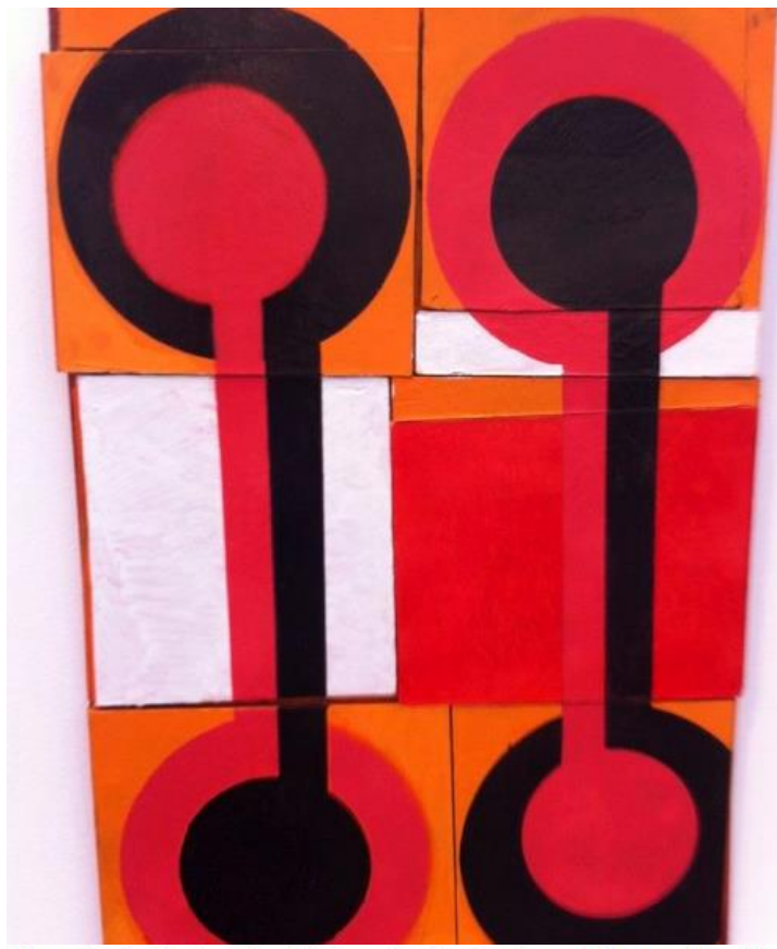
There's also the London First section for London art fair newbies, like 43 Inverness Street, who are showing HaYoung Kim's 'Modern Soup'.